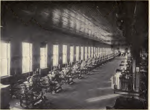
CENTRALIA ENVELOPE CO.